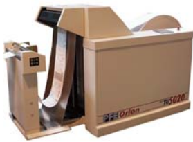
Model TU5020/AB Unwinder with Air Box (Full loop control for High Speed Inserter)