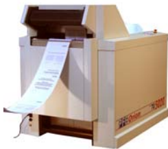
TU5020/LC Unwinder with air blown Loop Control Box