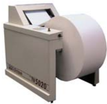
Model TU5020 Unwinder with Loop Control Box