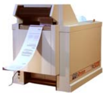
Model TU5020/LC Unwinder with air blown Loop Control Box