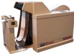
Model TU5020/AB Unwinder with Air Box (Full loop control for High Speed Inserter)